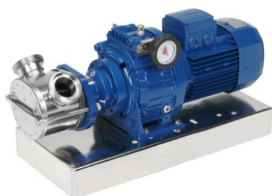
VA MECHANICAL VARIABLE SPEED DRIVE