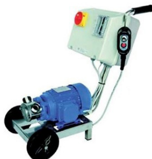
INV INVERTER CONTROLLED WITH CONTROL PANEL