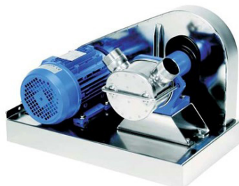
4GR BELT DRIVEN ON BASE