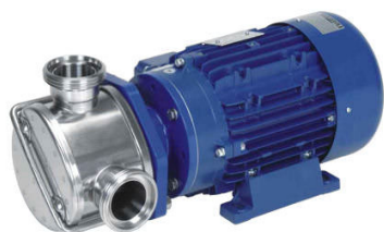
FEP ELECTRIC CLOSE COUPLED