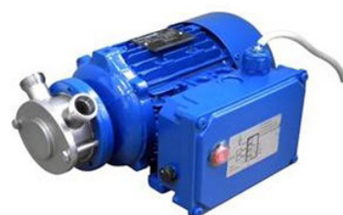
MINIVERTER INVERTER CONTROLLED